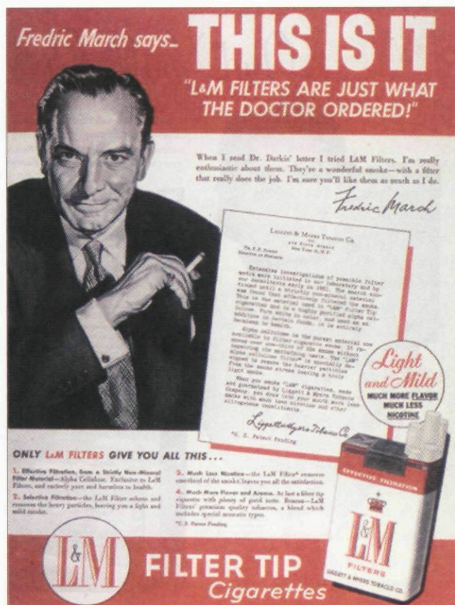
FIGURE 6—Actor Fredric March in an advertisement for L&M Filters: “This Is It.” Source: Life Magazine . February 22, 1954.

and "Why is it, doctor, that one filter cigarette gives so much more protection than any other?" One advertisement mentioned how "thousands" of physicians at a recent AMA convention witnessed "a convincing demonstration. . . [of] the effectiveness of the MICRONITE FILTER" and included photos of the experiment demonstrated there. In their marketing of Kent, Lorillard had created a campaign reminiscent of those designed by Philip Morris and RJ Reynolds in the 1930s and early 1940s. 54 Just as in those earlier advertisements, Lorillard called on physicians to interpret scientific results using their individual, clinical judgment. But the swift and vehement reaction to these advertisements clearly illustrated how the social and scientific climate had shifted. A 1954 JAMA editorial labeled the reference to physicians and the AMA convention an "unauthorized and medically unethical use of the prestige and reputation of the American Medical Association." 55 No longer could tobacco companies count on physicians to serve as public advocates of their product.