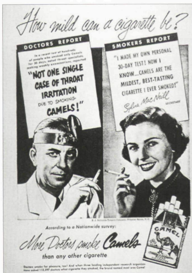
Figure 5—Advertisement: “How mild can a cigarette be?”

In another example, Anne Jeffreys, a stage and screen star, insisted, “The test was fun and it was sensible !” Parallel to earlier solicitation of physicians’ opinions, in this series of advertisements RJ Reynolds requested that smokers determine the safety of Camels on their own and praised their acumen. With some advertisements calling on